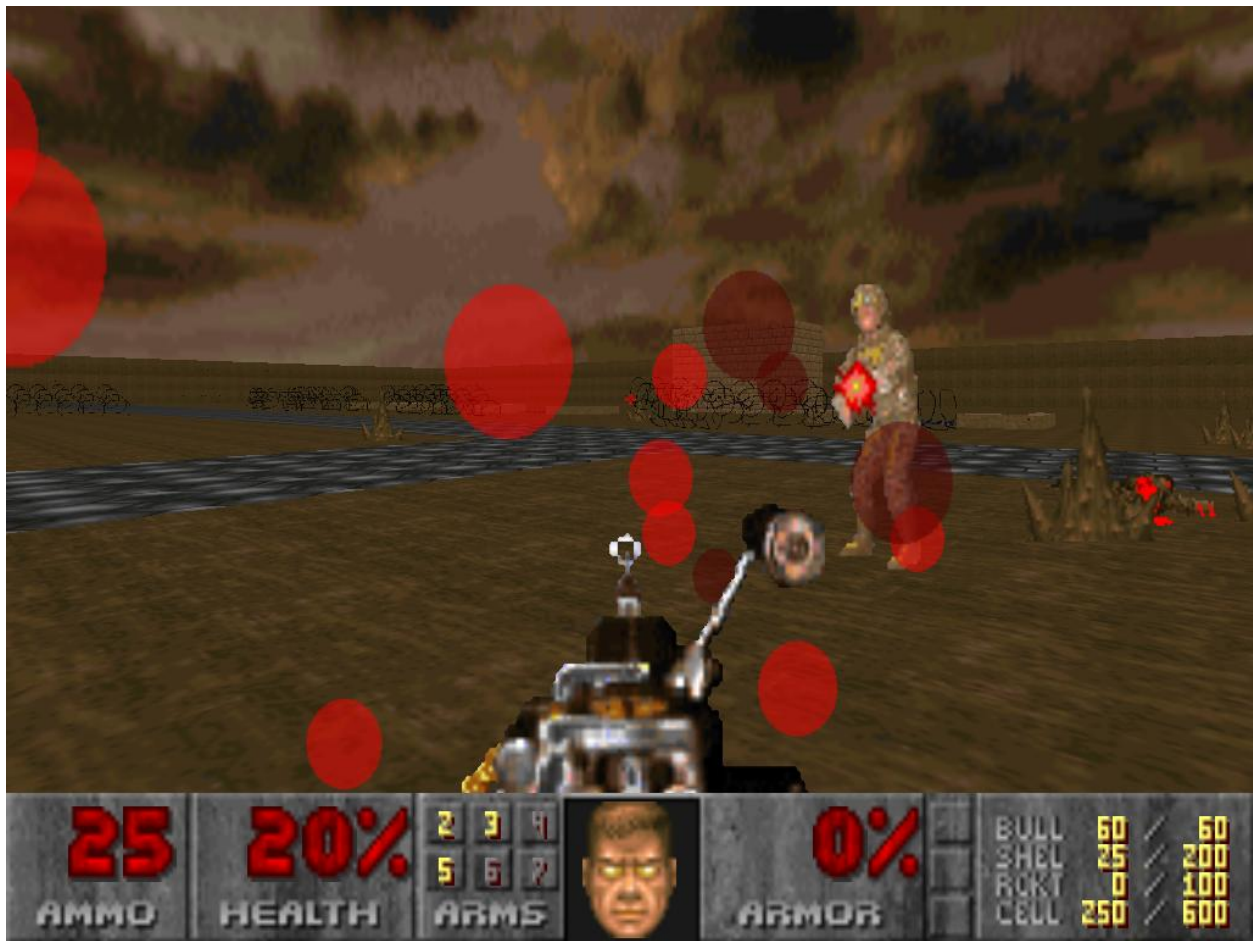
Figure 2. US Marine Corps Modification of DOOM.

Virtual world technology has come to the military from its roots in entertainment. Early concepts on the use of games were being demonstrated as early as 1996. The Marine Corps modified the extremely popular 3D shooter DOOM and simply labeled it "Marine DOOM" [9,10]. Though they generated a great deal of interest, the game was so primitive that it was very hard to imagine any real value in using these systems for a serious military purpose (Figure 2). Looking forward from 1996, it was almost impossible to imagine the computational and visualization power that would exist in a common desktop computer just ten years later. As a result, the concept of a military training system based on game technologies was delayed for almost a decade as computer technology advanced the power of the desktop systems to a level much closer to that found in the traditional, large scale simulators.