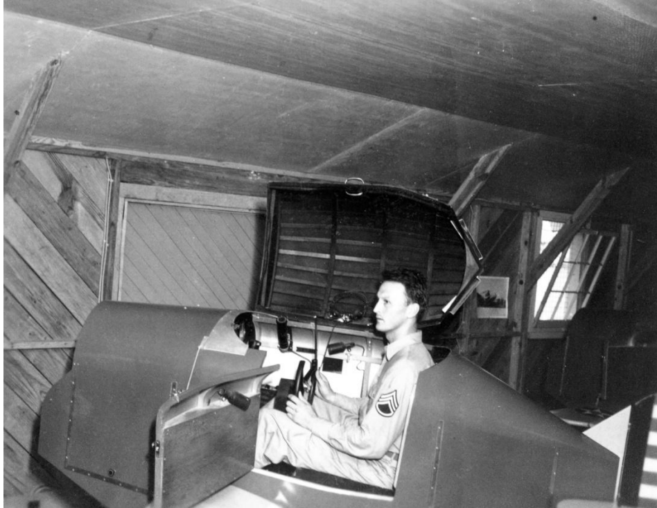
Figure 1. Link "Blue Box" Trainer, 1942.